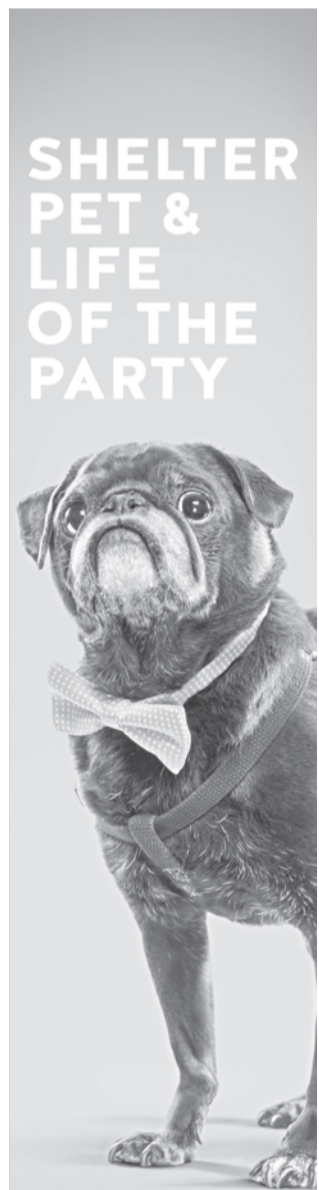
Amazing stories start in shelters and rescues. Adopt today to start yours.

2018 YAMAHA WR250R garage, 4k, excellent condition. Must sell $3,000. 607-638-1982.